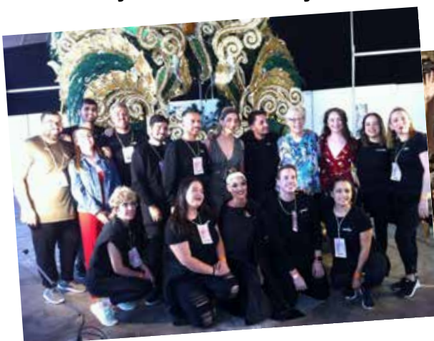
Figure out what you want to do with your life

This is one of the main reasons and one of the biggest benefits of Erasmus exchange program. It is proven that an exchange program boosts your CV and helps you stand out in the job market. About 64% of employers consider an international experience to be important for recruitment. Furthermore, an exchange program will provide you soft skills like adaptability, taking initiative and proactivity, which are crucial for future jobs.